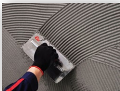
Spread paste on the substrate