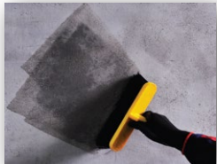
Make sure the surface is clean