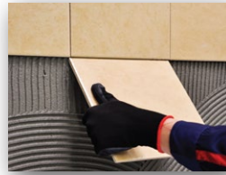
Place tile onto the adhesive bed

Note: The open time of Tile Adhesive can be drastically reduced under unfavourable conditions such as extremely hot weather, strong wind, high temperature and highly absorbent substrates.