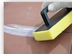
Applying the grout