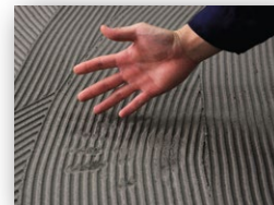
Adhesive bed is no longer sticky - "Skin-Over"